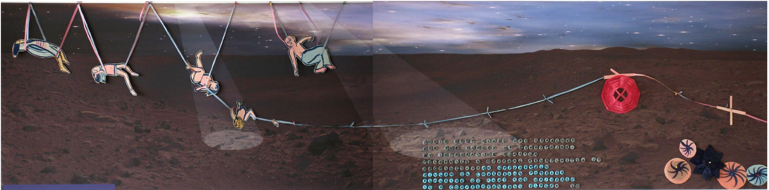
martian odyssey: string theory, stone lithography with digital output, 20 x 78 in.