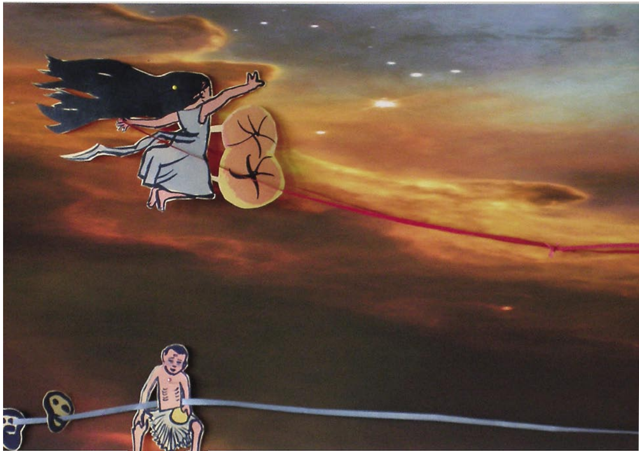
martian odyssey: flying, stone lithography with digital output, 20 x 78 in.