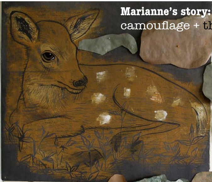
Hague, print installation detail, 2008

Marianne's story: thread 5 camouflage + the art of fitting in.