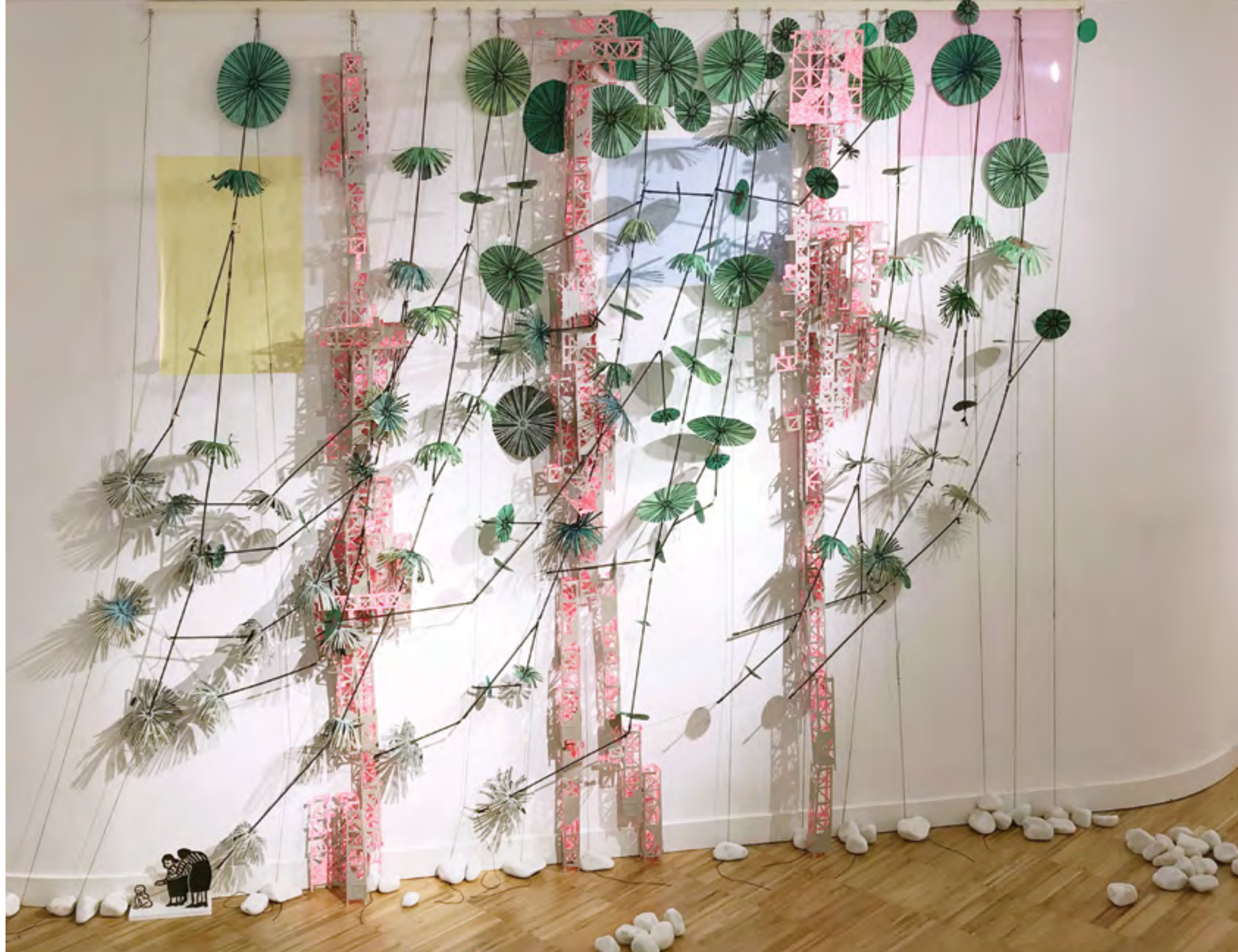
Installation, Pink city, Green branches , Centro Cultural Doctor Madrazo, Impact 10 International Multidisciplinary Printmaking Conference, Santander, Spain, 2018