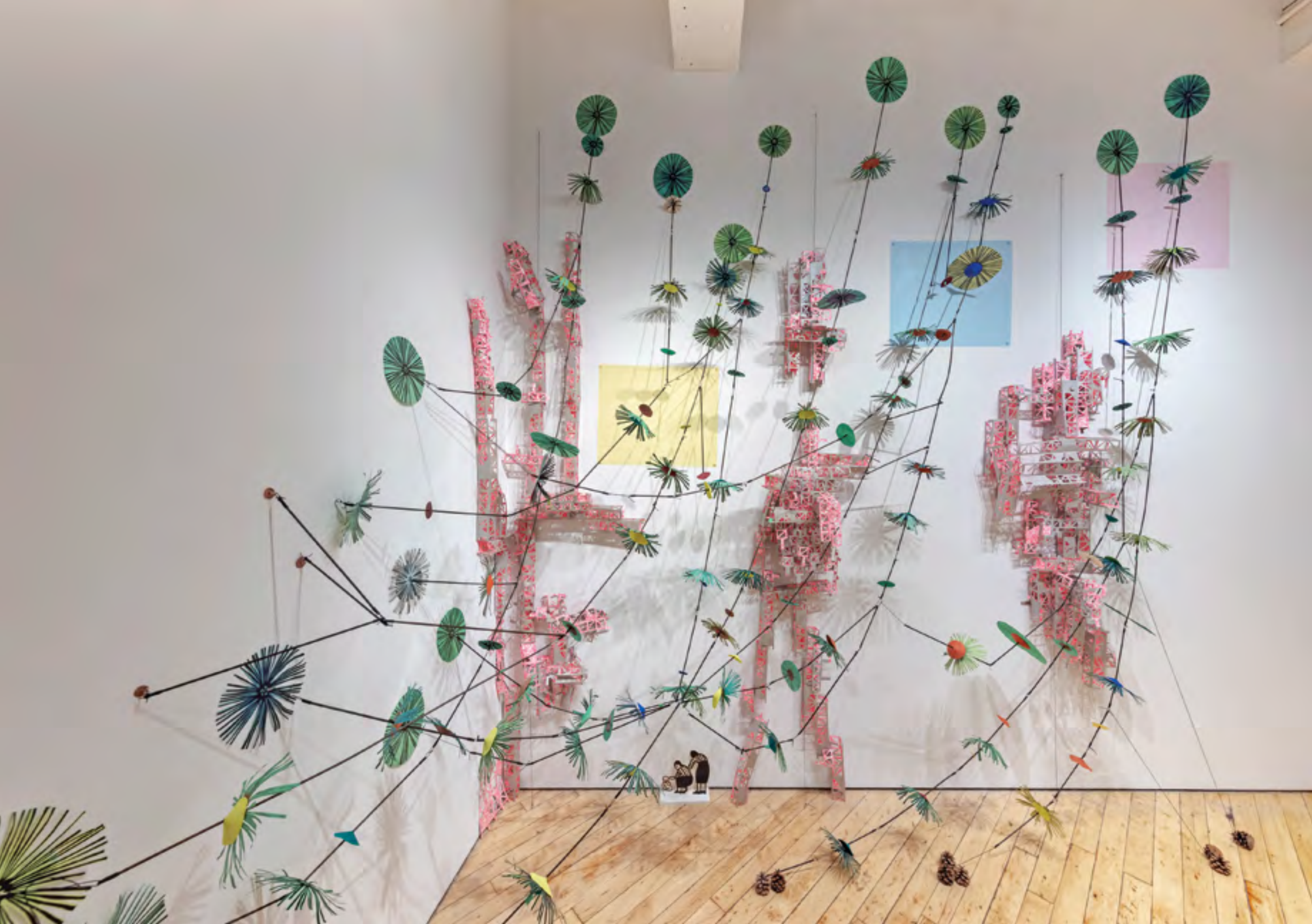
Installation, Pink city, Green branches revisited , Open Studio Printmaking Centre, Toronto, Canada, 2020